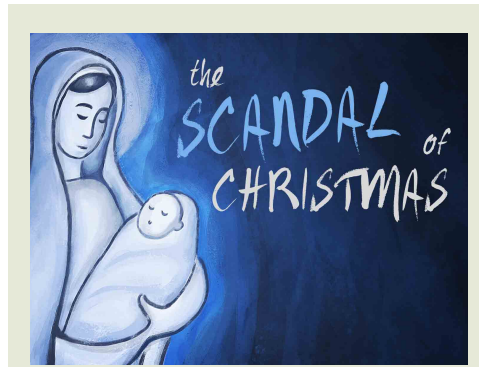
Encountering the story of Christmas with a fresh lens.

The story of Jesus Christ entering the world in the New Testament is a story laden with scandal. The term “scandal” or “scandalous” implies